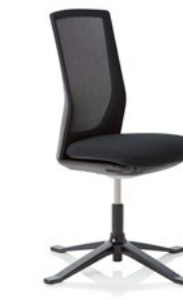
HÅG Futu Comm mesh 1102 FutuKnit mesh Night – MEH099