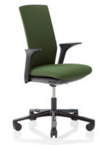
HÅG Futu 1200-S FutuKnit solid Forest – FTU104