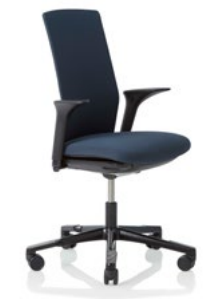
HÅG Futu 1200-S FutuKnit solid Dusk – FTU102