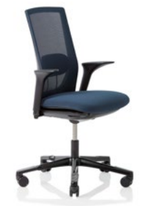
HÅG Futu 1100-S* FutuKnit mesh Dusk – MEH102