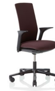
HÅG Futu 1200-S FutuKnit solid Aubergine – FTU103