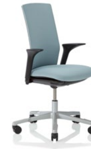
HÅG Futu 1200-S FutuKnit solid Frost – FTU100