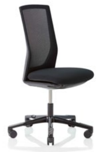
HÅG Futu Comm mesh 1102** FutuKnit mesh Night – MEH099