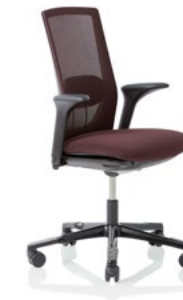
HÅG Futu 1100-S* FutuKnit mesh Aubergine – MEH103