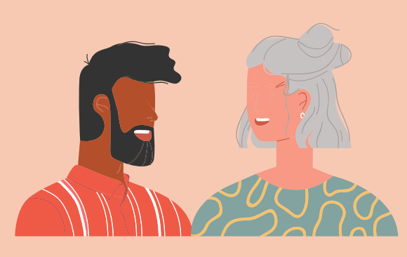
Face me when you speak.