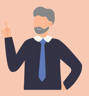
Try using gestures or drawings.