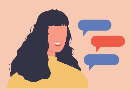
Keep sentences short.