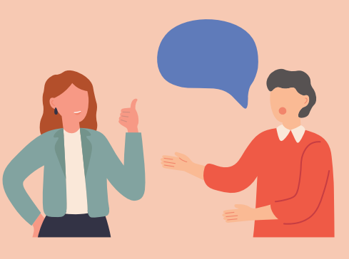
Speak slowly and clearly.