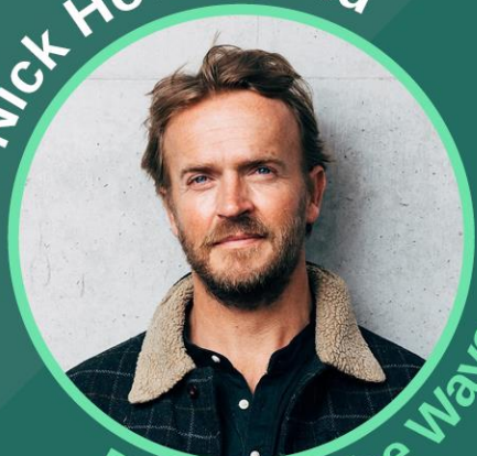
Founder, The Wave