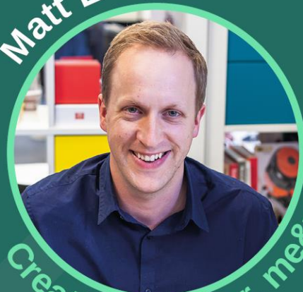
Creative Director, me&you